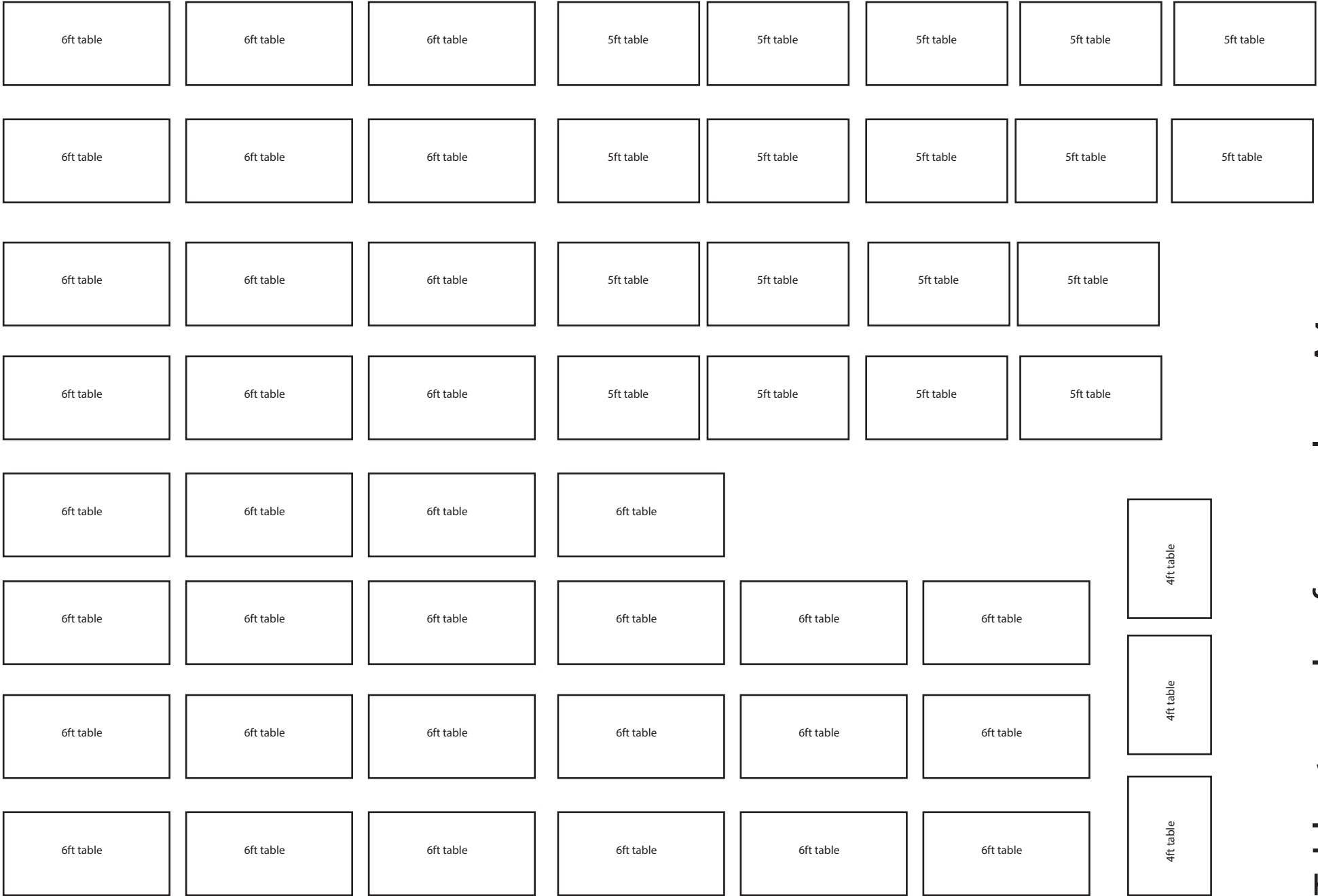
Tables to scale of room plans A4